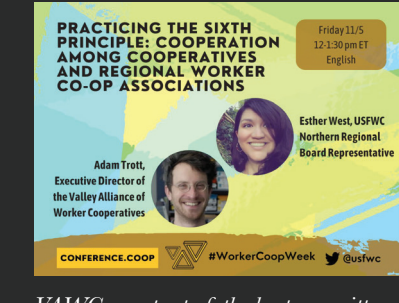
VAWC was part of the host committee and presenters for #WorkerCoopWeek.

The 5th Co-operative Principle of Education, Training and Information remains one of our guiding lights. We created the tailor-made Start Up Worker Co-op Workshop Series to support our four co-op start up members. We brought in guest speakers and best practices from members on topics from financial literacy and history of the co-op movement to understanding bylaws and maximizing governance.